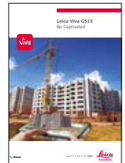
Leica Viva GS15