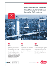
Leica CloudWorx Ultimate