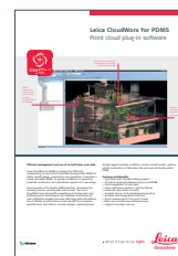
Leica CloudWorx for PDMS

Copyright Leica Geosystems AG, 9435 Heerbrugg, Switzerland. All rights reserved. Printed in Switzerland - 2017. Leica Geosystems AG is part of Hexagon AB. 867272en - 11.17