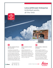
Leica JetStream Enterprise