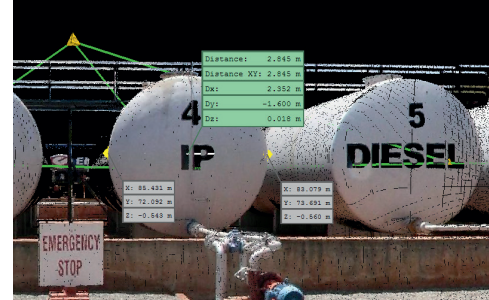
Quick Measure and Snapshot

With one click, push your data to TruView and Jetstream, E57, PTS, PTG or PTX and a comprehensive registration report.