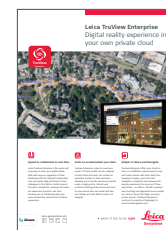
Leica TruView Enterprise