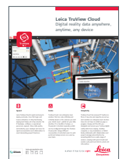
Leica TruView Cloud

Leica Geosystems AG Heinrich-Wild-Strasse 9435 Heerbrugg, Switzerland +41 71 727 31 31